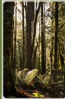
Forest views around Inland Lake

Please call Swens Contracting at (604) 885-3714 for more information.