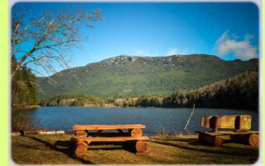
Lakeside picnicking at Inland Lake