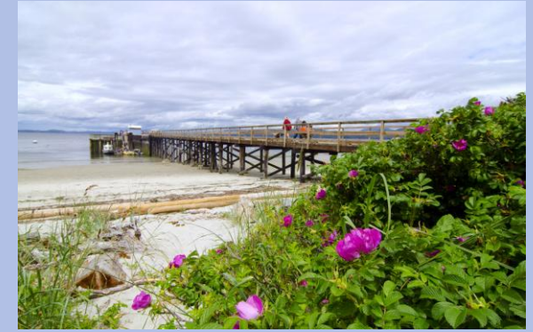
Savary Island Wharf