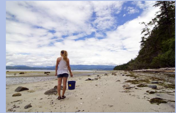
On the beach