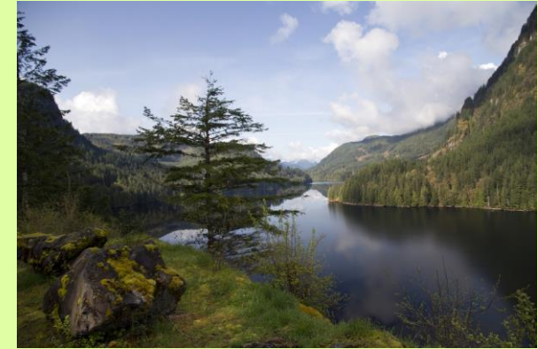
Goat Lake, part of the Canoe Route