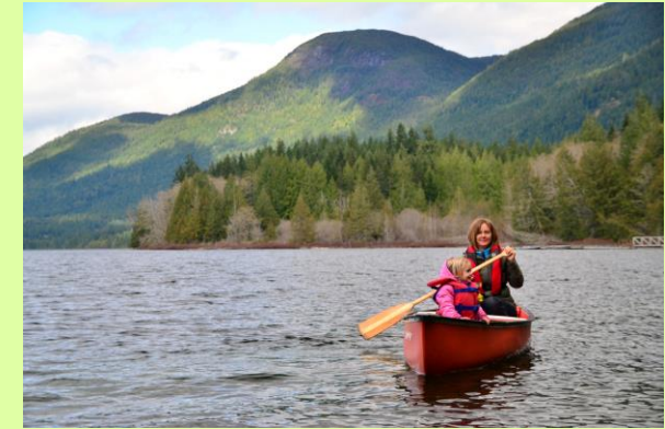
World-class canoeing and views