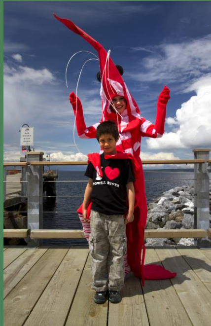
Spot Prawn Festival Mascot - Westview Marina Wharf

Powell River Visitors Centre 4760 Joyce Avenue Powell River, BC V8A 3B6