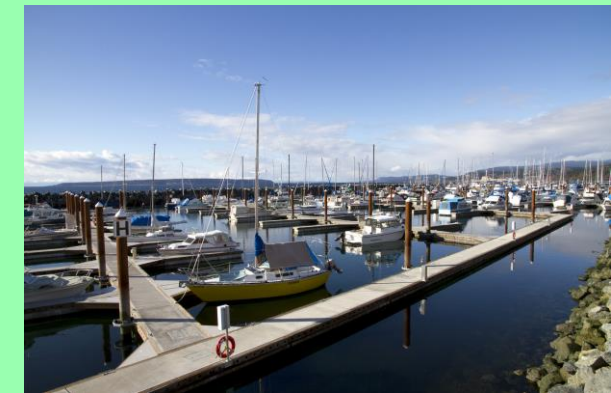
Westview South Harbour