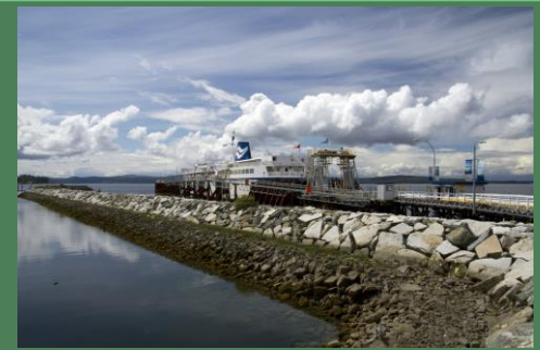
Ferry dock at the Westview Marina